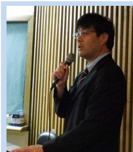
Prof. Yoshiyuki Kizawa from Japan.

In 2010, there were 1,197,012 registered deaths, and was expected to rise to 1,660,000 by 2040. Among the total deaths in 2010, 30% death of cause was cancer, 16% and 11% were caused by cardiac diseases cerebral and vascular accident. Currently 79% deaths occurred in Hospitals and